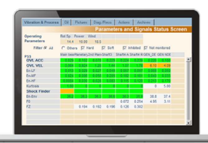
Defect Detection Grid (2DG) as presented to the expert in ONEPROD NEST Analyst software

Scanning in real-time the operating status of the machine, KITE's built-in intelligence allows catching the best data for diagnostic purposes. Irrelevant information measured during changing conditions can automatically be filtered out and eliminated. All captured data is tagged with extreme precision, allowing retention of only the most relevant information. The wind turbines' health status can be collected with a very high accuracy relying on just a few key targeted indicators.